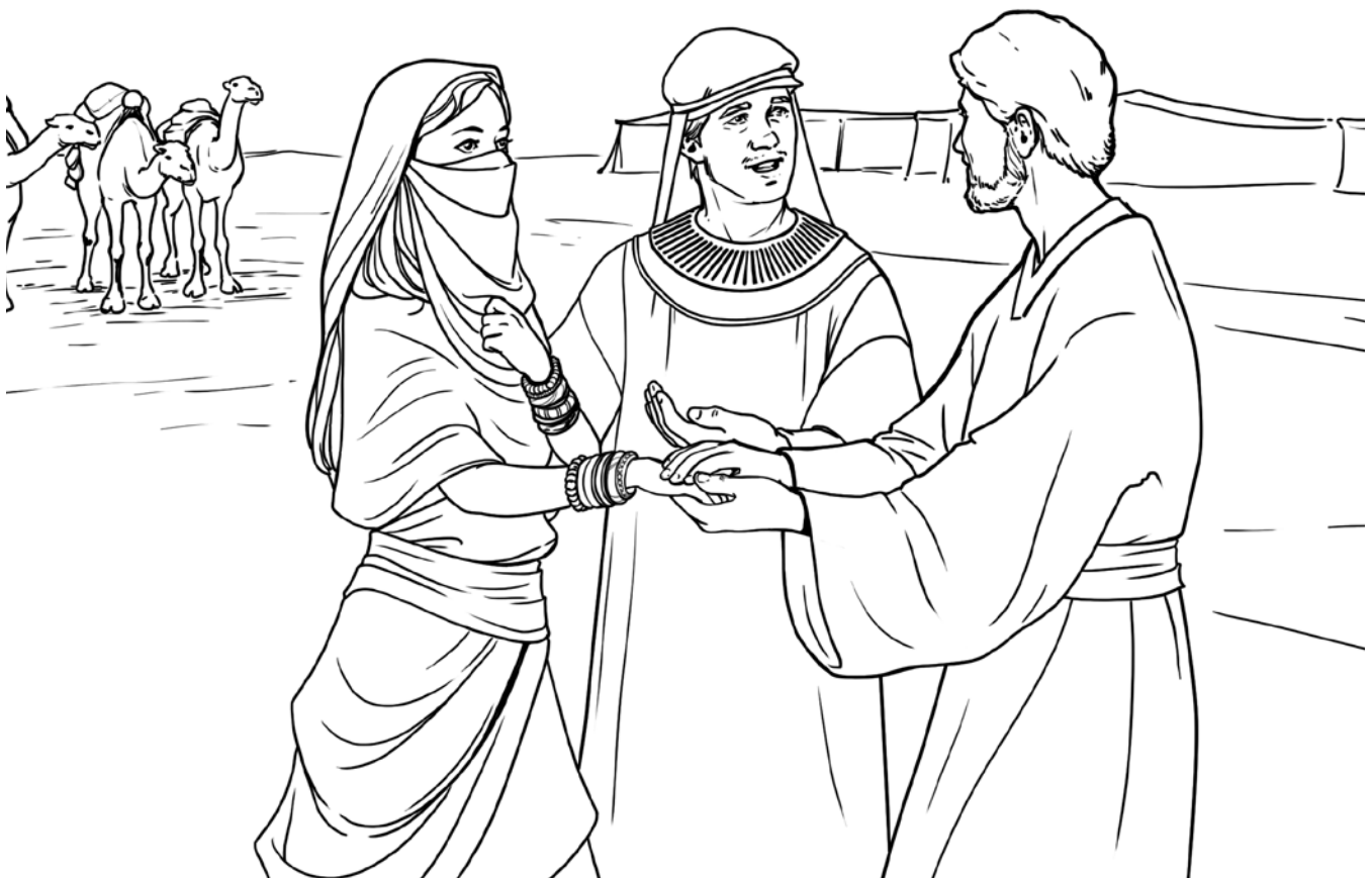
Isaac and Rebekah are introduced.

Several days later, as they neared the end of their journey, Rebekah saw a man walking in the fields and