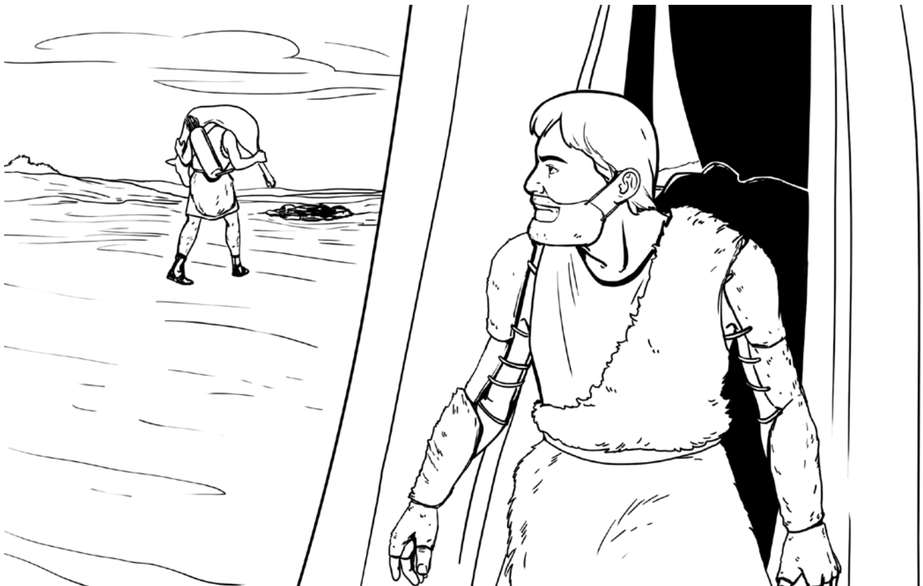
Esau returns as Jacob leaves Isaac’s tent.

“You and your family will settle far away from the prosperous land,” Isaac told Esau. “You will have to hunt and fight for your life. Your family will serve your brother’s family. But