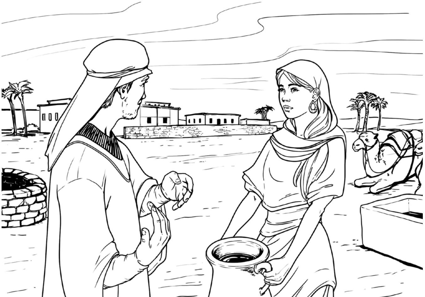
Rebekah gives water to Abraham's chief servant.

Laban unharnessed the camels, fed them, and gave them space among his animals where they could rest. After cleaning up for a meal, the group prepared to eat. However, Abraham's servant said he first