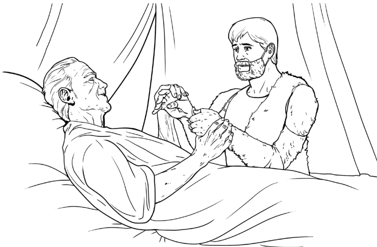
Jacob tricks his father into giving him the firstborn's blessing.

After eating the meat, Isaac blessed Jacob, saying, "I pray that the great God will give you well-watered, abundant fields, with much