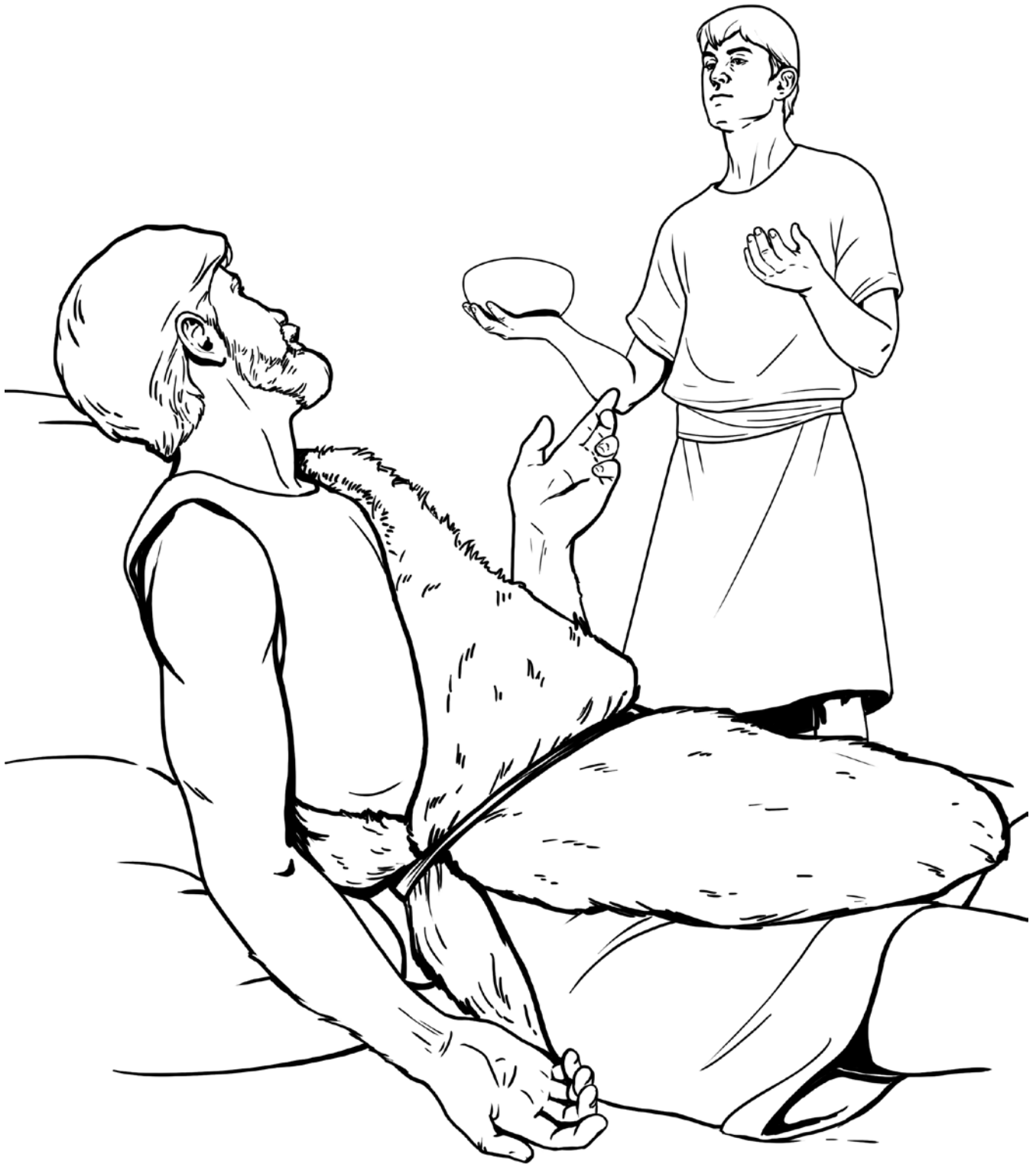
Esau sells his birthright for a bowl of lentil soup.